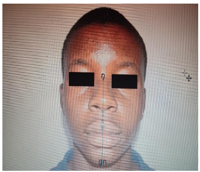
Fig. 3: Height measurement from the nasion to gnathion