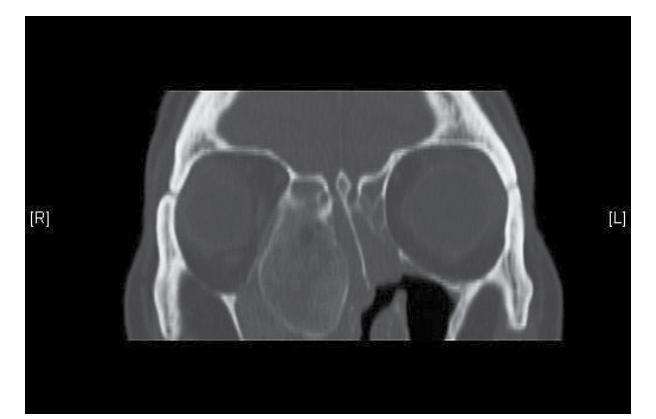
Figure 3: Computerised tomography image of brown tumour three years after parathyroidectomy. The brown tumour can be seen invading the ethmoid air cells and medial wall of the orbit

Examination at one year postoperatively showed resolution of the diplopia, slight reduction in the size of the brown tumour and no evidence of recurrence on whole body Tc MIBI and neck ultrasound. Follow-up CT imaging three years postoperatively (Figure 3) demonstrated a dramatic decrease in the size of the lesion and its associated mass effects, but with an unusual "ground glass" appearance attributable to the secondary ossification of the large tumour, thought to be healing by fibrosis. Six years postoperatively he remained asymptomatic, but with only partial regression of the mass, as expected, due to the ossification of the lesion. There was no evidence of recurrence of the parathyroid carcinoma, and the PTH level was 41.44 ng/l (normal range 15 to 65 ng/l). Subsequent renal ultrasonography revealed two benign cysts in the right kidney.