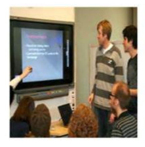
Fig.2. Collaboration (www.edu.com)

modern education system, student participation has more increased and the role of teacher becomes paler. In other words the use of modern tools of education, cause to significant changes in the architectural design process which is an important architectural course. Using these tools alongside traditional tools of architectural design in addition to accelerating the design process, increase creativity of students. Using a variety of graphic software, digital plates and Leap motions have a significant impact in the field.