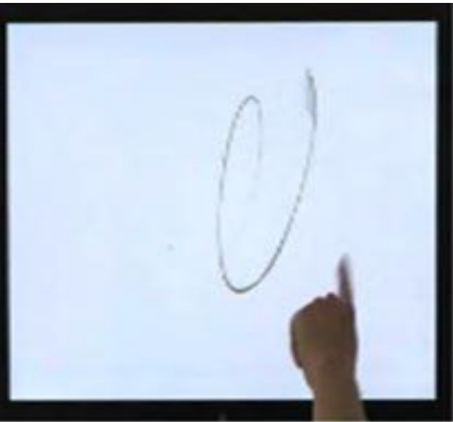
Fig.5. Increase creativity (online.xsj.com)