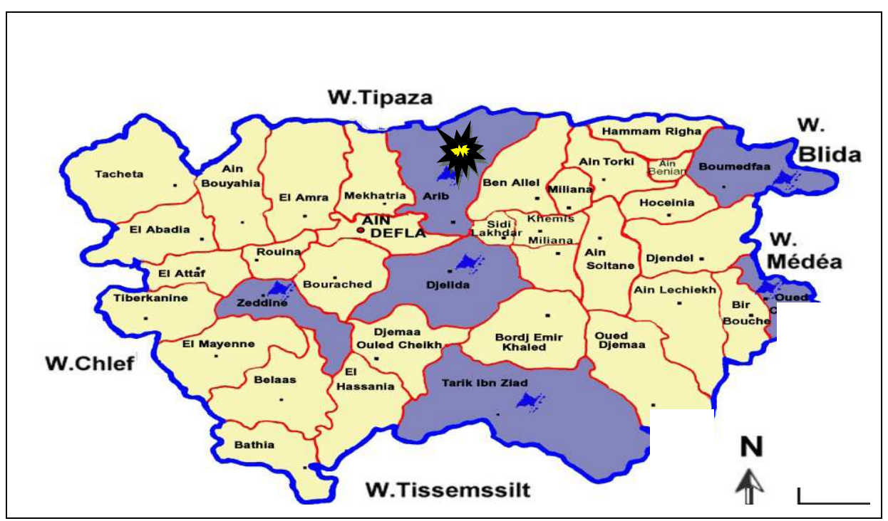
Fig.1. Location of Arib area in Ain Defla (Algeria) (Agence nationale de Développement de l'Investissement (ANDI), 2013)

located 145 kms South West of Algiers (36°17'16.09"N 2°3'56.96"E), it shares a boundary with Tipaza in the North, Tissemsilt in the South, Chlef in the West and Blida in the East.