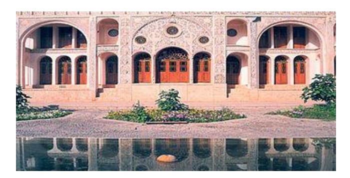
Fig.3. A traditional Iranian yard in Kashan