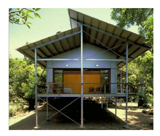
Fig.1. A well naturally ventilated house (Bouchair and Downton, 2013) [9]

Researches show that in each of these climates there are some advises to have a reliable passive cooled air condition building. Figure 1 shows a well naturally air conditioned house. Situations of above different climates are presented here respectively (Bouchair and Downton, 2013)[9].