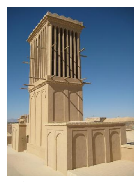
Fig.4. A wind catcher in Yazd, Iran

The passive cooling effects of a courtyard of a small building also have been studied [19]. The passive cooling features considered in one of these researches have been the shading effects of courtyard walls and trees planted next to the south wall of the building, the presence of a pool, a lawn and flowers in the yard, and the wind shading effects of the walls and trees. Results show that these features alone cannot maintain thermal comfort during the hot summer hours in hot dry areas, but reduce the cooling energy requirements of the building to some extent. They have an adverse effect of increasing the heating energy requirements of the building slightly. The same savings in cooling energy needs of the building can be obtained through many features such as wall and roof insulation, double-glazed windows, Persian Blinds, and special sealing tapes to reduce infiltration. They all save on heating energy requirements as well [14].