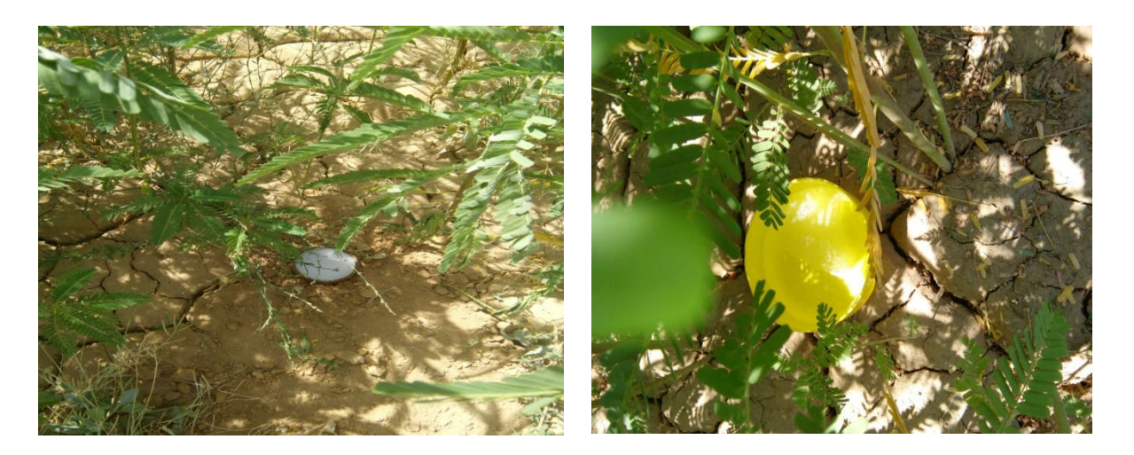
Fig.1. Methods used for sampling arthropods

The species caught by the interception traps, the yellow and hand plates are brought back to the laboratory of Zoology Agricultural and Forestry of the National Agricultural Superior School to determine them. This operation is carried out in particular by Professor Doumandji Salaheddine, using the keys of determination of the Coleoptera (PERRIER, 1927), Hymenoptes (PERRIER, 1940), Orthopteroids (CHOPARD, 1943) and Diptera (PERRIER, 1983) And (MATILE, 1993 and 1995).