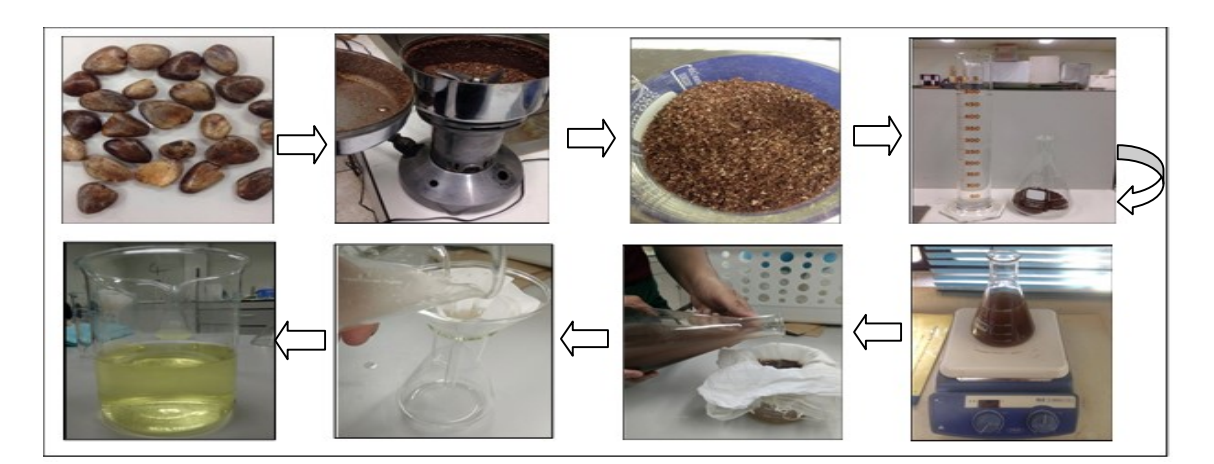
Fig.4. Process of seed extraction of Kadsura ananosma with aqueous alcoholic extraction by fermentation