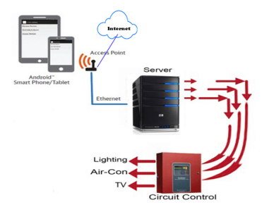
Fig.2. Components Diagram

identify and analyze the best possible solution based on the stated problem that would come up with a real time system that is significant to all users.