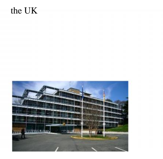
Figure3: The British Embassy