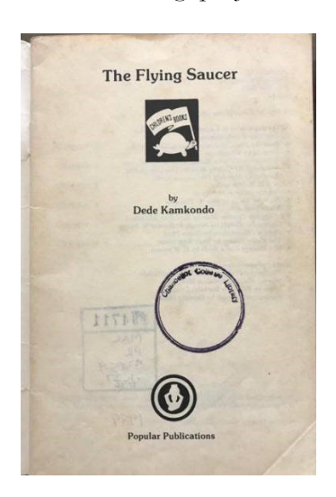
Figure 4: English Department, UNIMA, "Title page of The Flying Saucer". 2019. Photograph. JPEG.