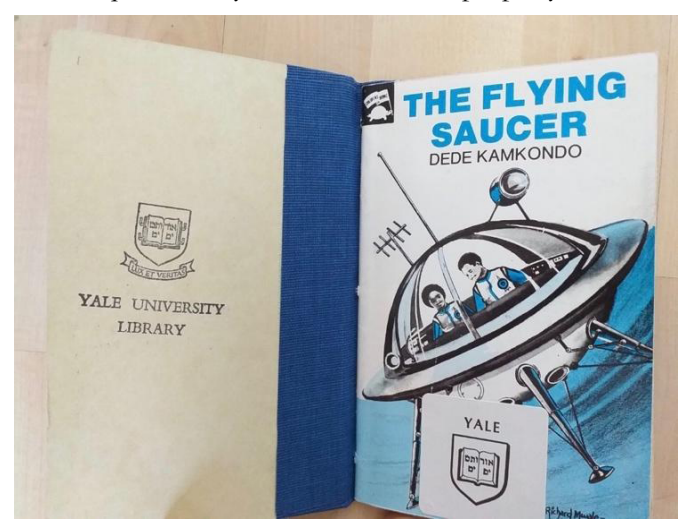
Figure 2: Woods, Joanna, "Dede Kamkondo's The Flying Saucer". 2019. Photograph. JPEG file.

On the inside of the back cover there are two more labels which function in much the same way. One is a barcode, much like the one found on the front cove inscribed with the aforementioned institution's name, presumably for checking the book in and out of the library, and below it is a white table entitled "Date Due", which appears never to have been used. Together the labels mark the activity of the library cataloguing process. While this is the case, they also contribute to the fact that the cover of this text is "a fringe" which controls one's entire reading of the text (Genette, 1997, p.2). Whatever the intentions of the actors in the archive, the text is now unquestionably marked as Yale's property; the text is explicitly