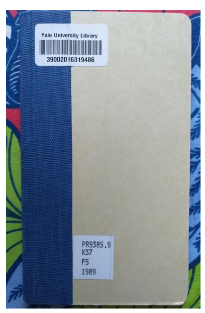
Figure 1: Woods, Joanna, "Yale's cover: The Flying Saucer". 2019. Photograph. JPEG file.

The Flying Saucer was added to Yale's library catalogue on 1st June 2002. Although we do not know the appearance of the original text, I am suggesting that the initial materiality of the physical text as we see it now was acquired in the archive (see Figure 1). There are reasons for this suggestion. With no trace of the