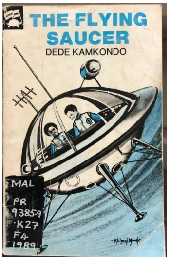
Figure 3: English Department, UNIMA, "Front cover of The Flying Saucer". 2019. Photograph. JPEG.

in Malawi have not gone as far as concealing Kamkondo's novella. For one thing, the title is clearly visible.