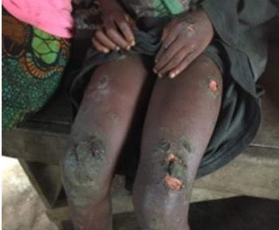
Figure 2: Photographs of index case 8 days after onset of illness, Burdue Town, Dodian District, Rivercess County, June 2017