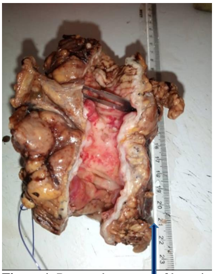
Figure 1. Resected segment of large intestine with a circumferential constricting mass (arrow) along its length.