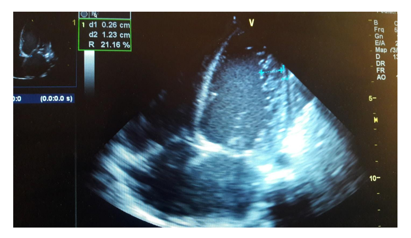
Figure 1: Apical 4-chamber transthoracic echocardiographic image of patient with LVNC demonstrating prominent ventricular trabeculations and deep intertrabecular recesses predominately in the apical and lateral walls. Original clinical image from UATH non-invasive cardiac laboratory.