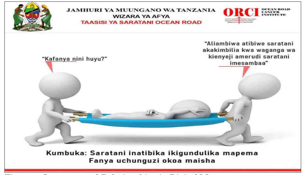
Figure 3: Interpersonal Relationships in Digital Memes

In visual grammar, semiotic modes reveal relationships between the artefact maker and the target audience, or the relationship between two or more entities on an image. To substantiate this metafunction, the digital meme as shown in Figure 3 from Ocean Road Cancer Institute (ORCI) was analyzed. The makers created the meme as a response to the behaviour of cancer patients and community in general. There are some reported cases about unsubstantiated decisions of cancer patients on suitable treatments. Some patients forsake modern cancer treatments over traditional healers, witchdoctors, and preachers. As in Figure 3, the left participant asks: Kafanyaninihuyu? 'What happened to him/her?' the other replies: Aliambiwa atibiwe saratani akakimbilia kwa waganga wa kienveii, amerudi saratani imesambaa 'He/she was asked to receive conventional treatment for cancer but ran to native doctors, now the cancer has metastasized'. The caption at the bottom reads: Kumbuka: saratani inatibika ikigundulika mapema. Fanya uchunguzi, okoa maisha 'Remember: cancer can be treated if detected early. Take early tests, save [your] life'.