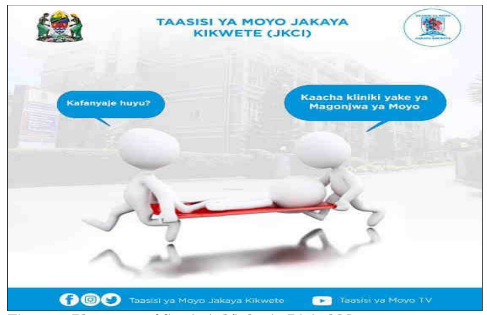
Figure 5: Placement of Semiotic Modes in Digital Memes

solicits information from the left-seated participant. Appearance of the seated participant signifies that something happened. The reader of the meme would then move eyes from right side to left side for key information. The point of departure here is that, the text (question) on the right is already known given the expression of the seated participant, and new information is accessible from the left side.