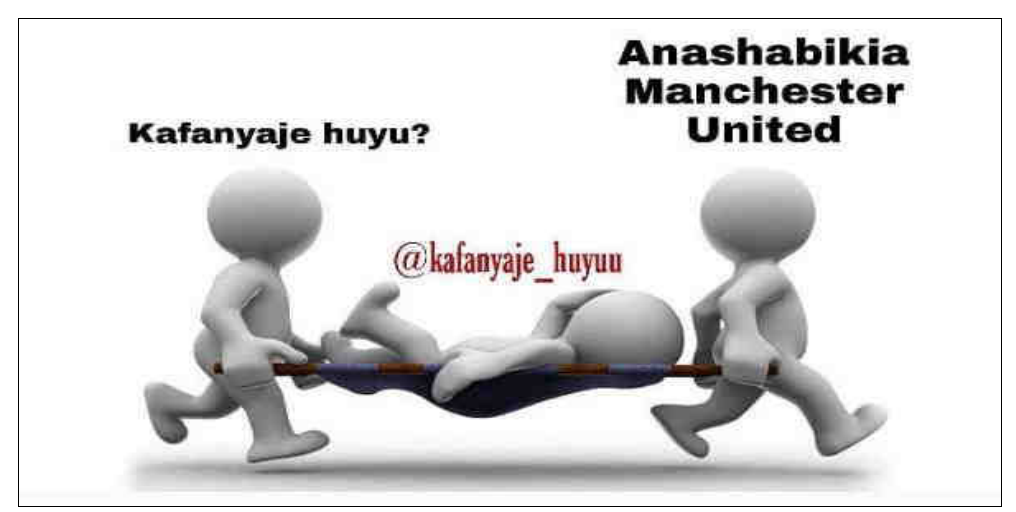
Figure 1: A Football Meme on Instagram

earliest forms of digital memes created by using punctuations. By then, online content programmers were looking for ways which could help one create meaning without being taken out of context. For instance, a written text is accompanied by a laughing emotion to express jokes (happiness). However, the technological growth enables online users to generate other forms of digital memes in which netizens begin using combinations of texts, images, videos (Hardesty, Linz, &Secor, 2019), graphic interchange formats (GIFs) (Al Rawi, Al-Musalli, & Rigor, 2021), and many others. The 'newer' form of online memes made up of 3D clip art figures was noted in Tanzania in March 2022 (Figure 1). The memes featured a combination of meaning making resources.