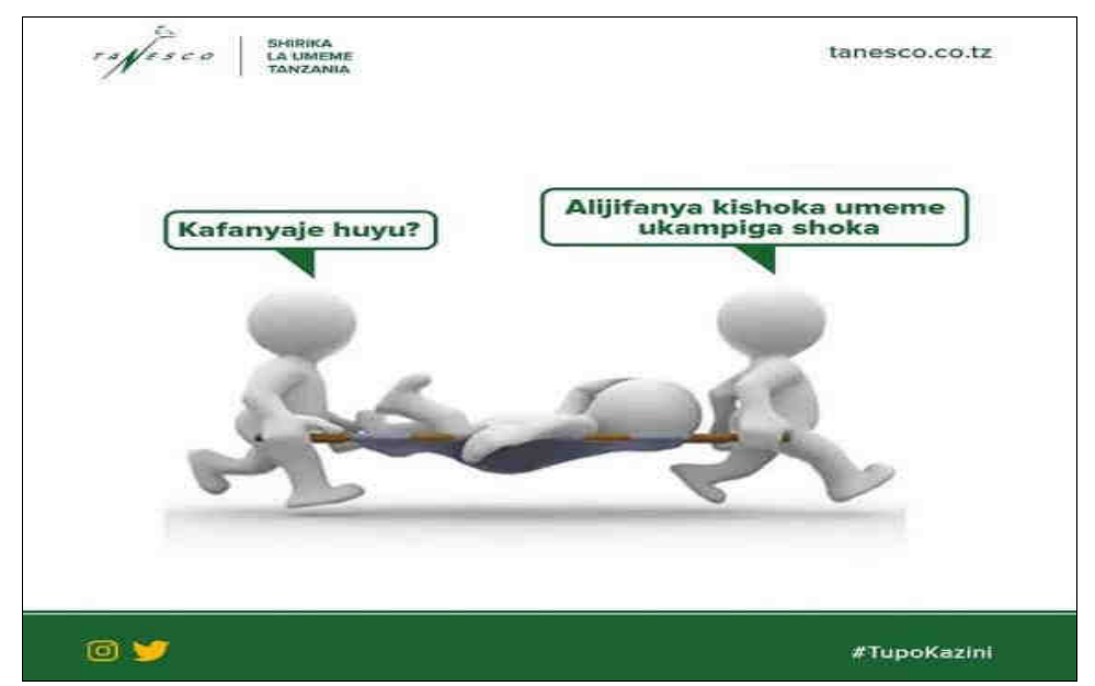
Figure 4: Textual Materialization in Digital Memes

The textual semiotic modes in the digital memes, as in any other semiotic artefacts, carry the same weight in making meaning. Despite the fact that it is the most privileged mode in most linguistic analyses, semiotic multimodal studies acknowledge the complementarity of all modes featured in any image (Kress, 2011). This postulation is as suggested by Johnson (1992) that the representational and interpersonal meanings of semiotic modes are more elaborated using texts than language. Figure 4 perfectly exhibits the role of textual modes in complementing other modes. This meme from TANESCO comprises two participants carrying the one on the stretcher. The carried participant seems incapacitated. However, at this point, the circumstance is full of uncertainties. The meme is imprecise. Nevertheless, the rear participant probes: Kafanyajehuyu? 'What has done? The other replies: Alijifanyakishoka. this umemeukampigashoka 'He pretended to be a specialist, he got electrocuted.