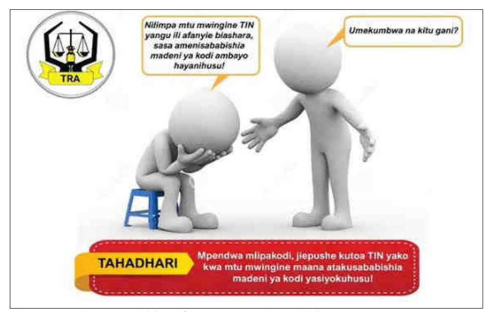
Figure 2: Ideational Metafunction in Digital Memes

Figure 2 features two participants which resemble human beings. One is seated on a stool, bowing, and covering his face with his bare hands (ashamed) and another standing with his hands spread toward the one; definitely awed. The one standing Umekumbwanakitugani? 'What has happened to you?' The seated one replies Nilimpamtumwingine TIN yangu ili afanyie biashara, sasa amenisababishia madeni ya kodi ambayo hayanihusu'I gave a person my TIN to do business and now he has left me with unpaid taxes'. The bottom text reads: TAHADHARI: Mpendwamlipakodi, jiepushekutoa TIN yako kwa mtu mwingine maana atakusababishia madeni ya kodi vasiyokuhusu 'CAUTION: Dear taxpayer, avoid sharing your TIN with other people because they will cause you to pay tax debts which are not yours'. This meme exemplifies authentic life experiences which business persons carry out in business dealings. TIN sharing and tax evasion are vexing issues TRA is fighting. In addressing these matters, the meme makers have recreated the context of sharing TIN and warn about repercussions. Humorous as it may appear, indicated by the seated participant, this meme addresses this critical matter which can affect country's economy. The implication of the ideational meaning extends beyond the mentioned warnings. Rational decisions are called upon to mold law abiding citizens who respect government authorities. The meme aims to advocate behavioral change which business persons are required to embrace.