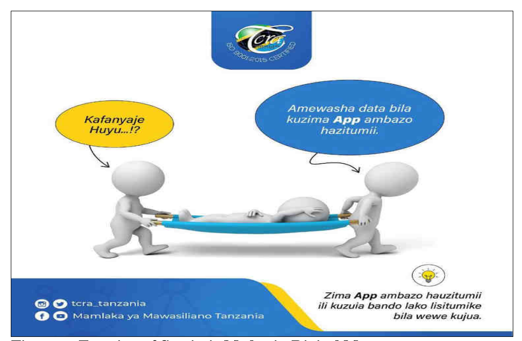
Figure 7: Framing of Semiotic Modes in Digital Memes

Visual materials consist modes which are linked in some way. The connectedness of the modes may indicate their relationships – whether strong or weak (Kress & van Leeuwen, 2006). Strong framing of the semiotic modes in visual materials is signaled by strong separation of Fragile or absence of framing signifies firm semiotic modes. connectedness of the modes. Visual resources such as images may comprise different ways of separating or merging the elements. For instance, as explained by Kress and van Leeuwen (2006), stronger lines in a collage of pictures establish uniqueness or individuality of the modes. But, thin lines or absence of lines manifest the associative nature of the modes.