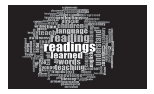
Figure 1: Initial codes

Throughout the process of conceptualizing, the researcher developed a set of concepts that could lead to potential categories and sub-categories (Strauss & Corbin 1998). These categories are discussed under the themes: Benefits of reading, ESL challenges, Social learning, and Transformation.