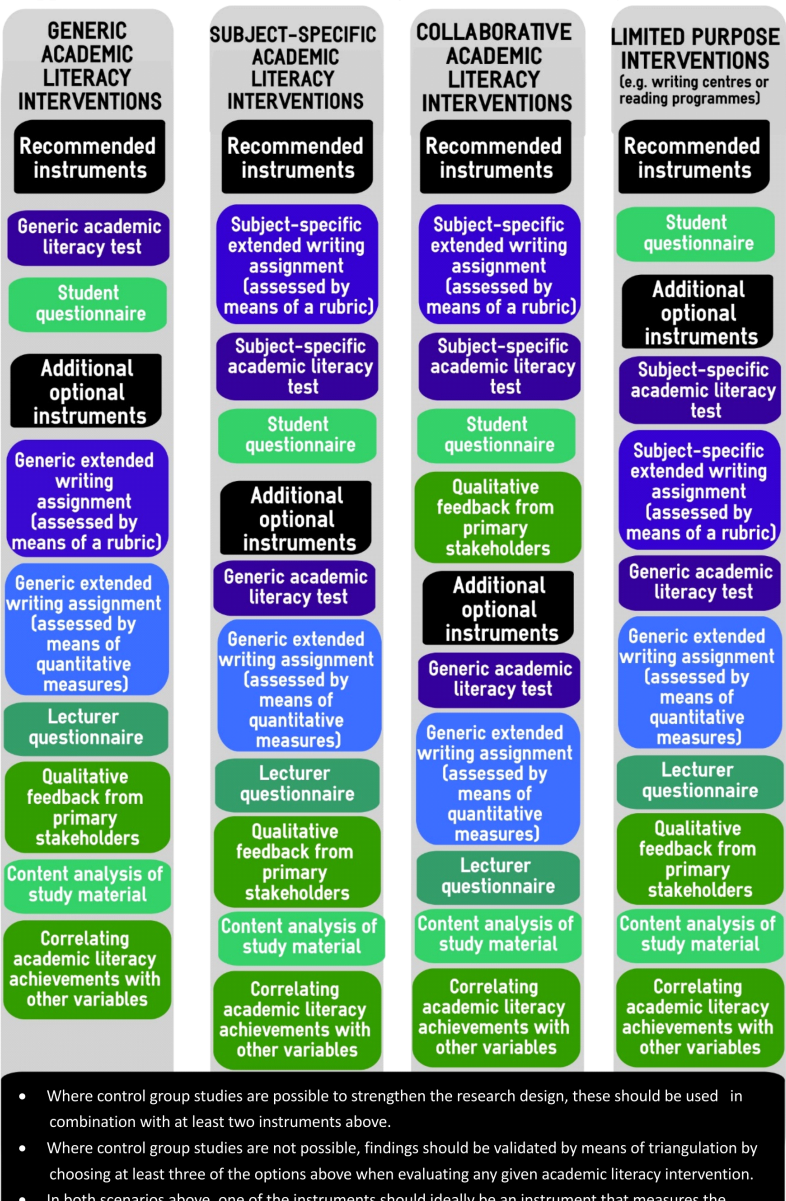
Appendix A: Proposed evaluation design for academic literacy intervention

In both scenarios above, one of the instruments should ideally be an instrument that measures the improvement in academic literacy abilities (coloured blue), and at least one should be an instrument that measures transfer (coloured green).