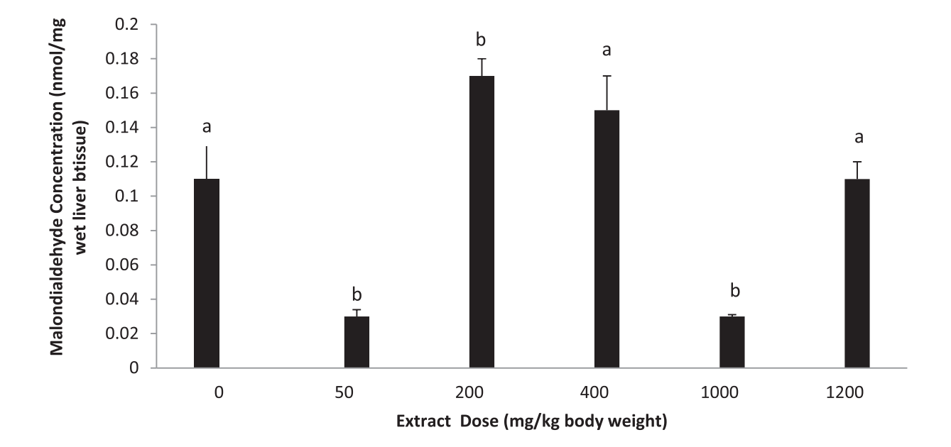
Fig. 3: Malondialdehyde concentration in rats administered ethanolic extracts. Height of each bar is mean value \pm SE for n = 4 determinations. Statistical difference between control and extract tested groups at P < 0.05 are indicated by different lower case alphabets.