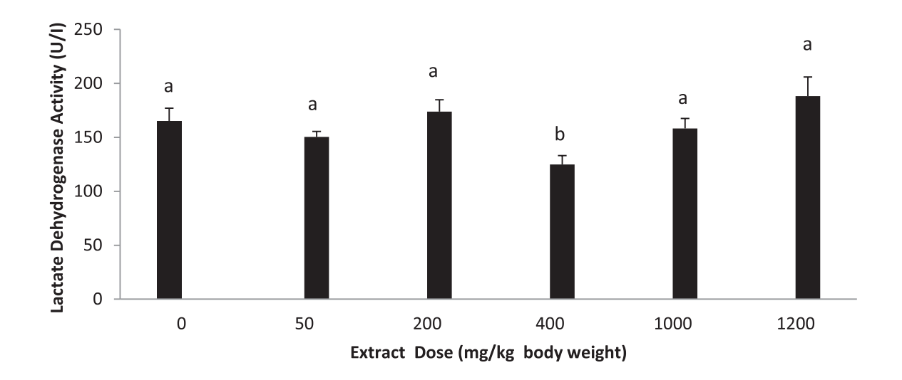
Fig. 1: Lactate dehydrogenase activity in rats administered ethanolic extract of Terminalia macroptera stem bark for 28 days. Height of each bar is mean value \pm SE for n=4 determinations. Statistical differences between control and tests were set at P < 0.05 and are indicated by different lower case alphabets.

Mean \pm SE values on the same row with different superscripts differ significantly ( P <0.05) for n =4.