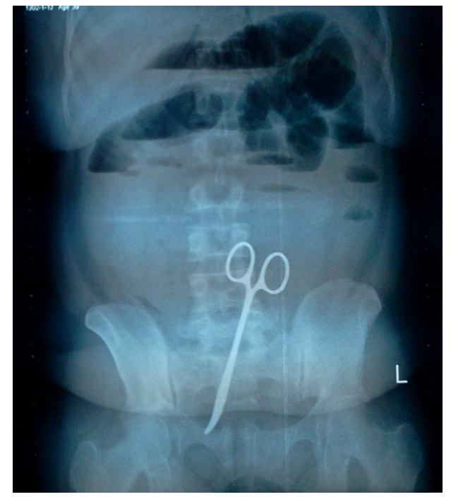
Figure 1: Plain erect abdominal radiograph showing an artery forceps in the peritoneal cavity. Also seen are air-fluid levels.

subsequently reviewed on two occasions after discharge and had no complaints on both occasions.