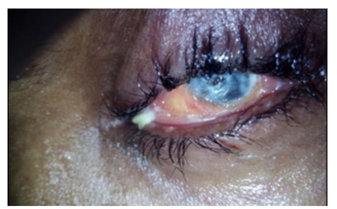
Fig. 5: Left eye of patient showing partial symblepharon and mucopurulent discharge.

Ocular ultra sound scan (B-scan) was performed for both eyes (with copious gel applied to act as a soft pad against the lids). This demonstrated an intact retinal outline, and no gross atypical intraocular reflections indicative of posterior segment pathology. However, multiple aberrations could be observed anterior to- and around the iris-lens interface in both eyes. Hence, a severe, localized anterior segment disease was suggested (Figure 6).