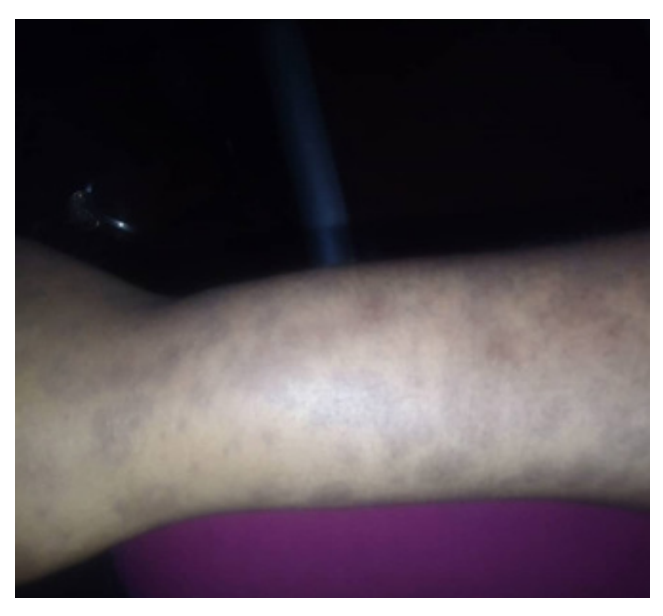
Figure 3. Patchy Hyperpigmented scars on an upper limb

Patient's entry visual acuity was hand motion (HM) for both eyes. Both lids were mildly oedematous; lashes were matted due to profuse mucopurulent conjunctival discharge with accompanying dry mucoid collections at the medial canthi. There was marked conjunctival hyperemia, chemosis and symblepharon