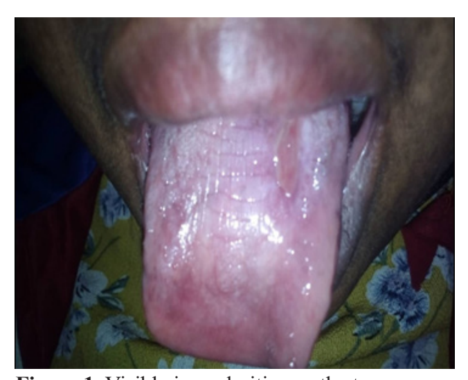
Figure 1. Visible irregularities on the tongue suggestive of previous desquamation

Patients' blood pressure and random blood sugar were unremarkable. Physical examination revealed cutaneous presentations (Figure 1) including an even distribution of flat, patchy hyperpigmented scars, most notably along the arms, legs and sides of the neck (Figure 2 and 3), anonychia (loss of fingernail structure on both hands and feet). These multifocal pigmented scars possessed a 'pseudo' bullseye morphology. The patient was then sent to a general physician for characterization and confirmation of these lesions.