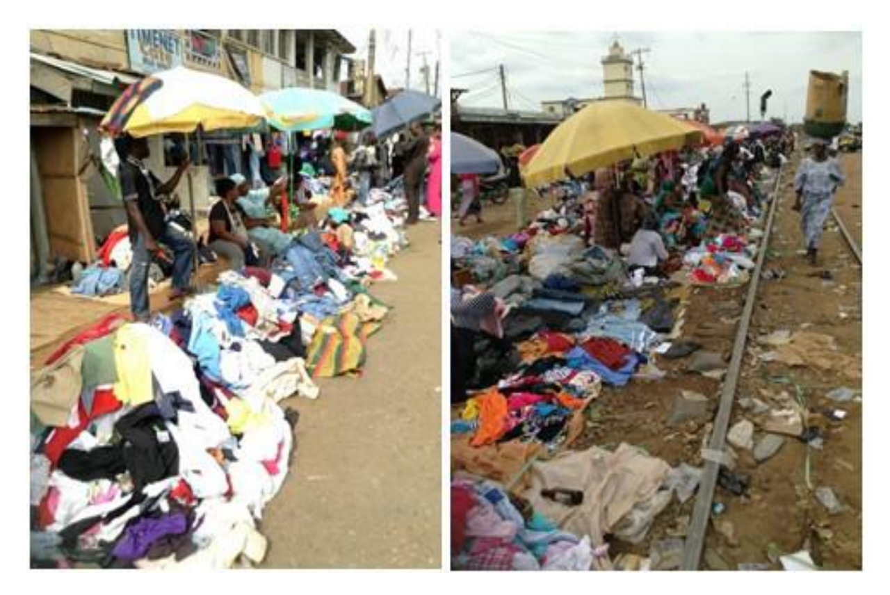
Figure 2: Pictures Showing Second Hand Clothes Market in Some Locations in Nigeria