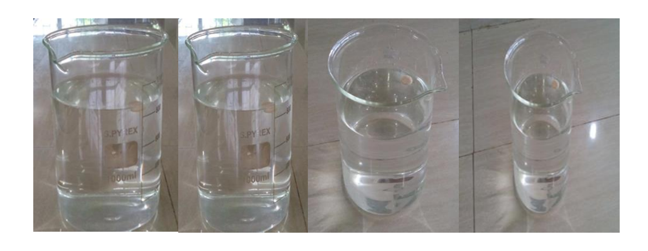
Figure 1: Photographs showing the in-vitro buoyancy characteristics of metronidazole floating tablets formulated with varying concentrations of Albemoschus esculentus gum