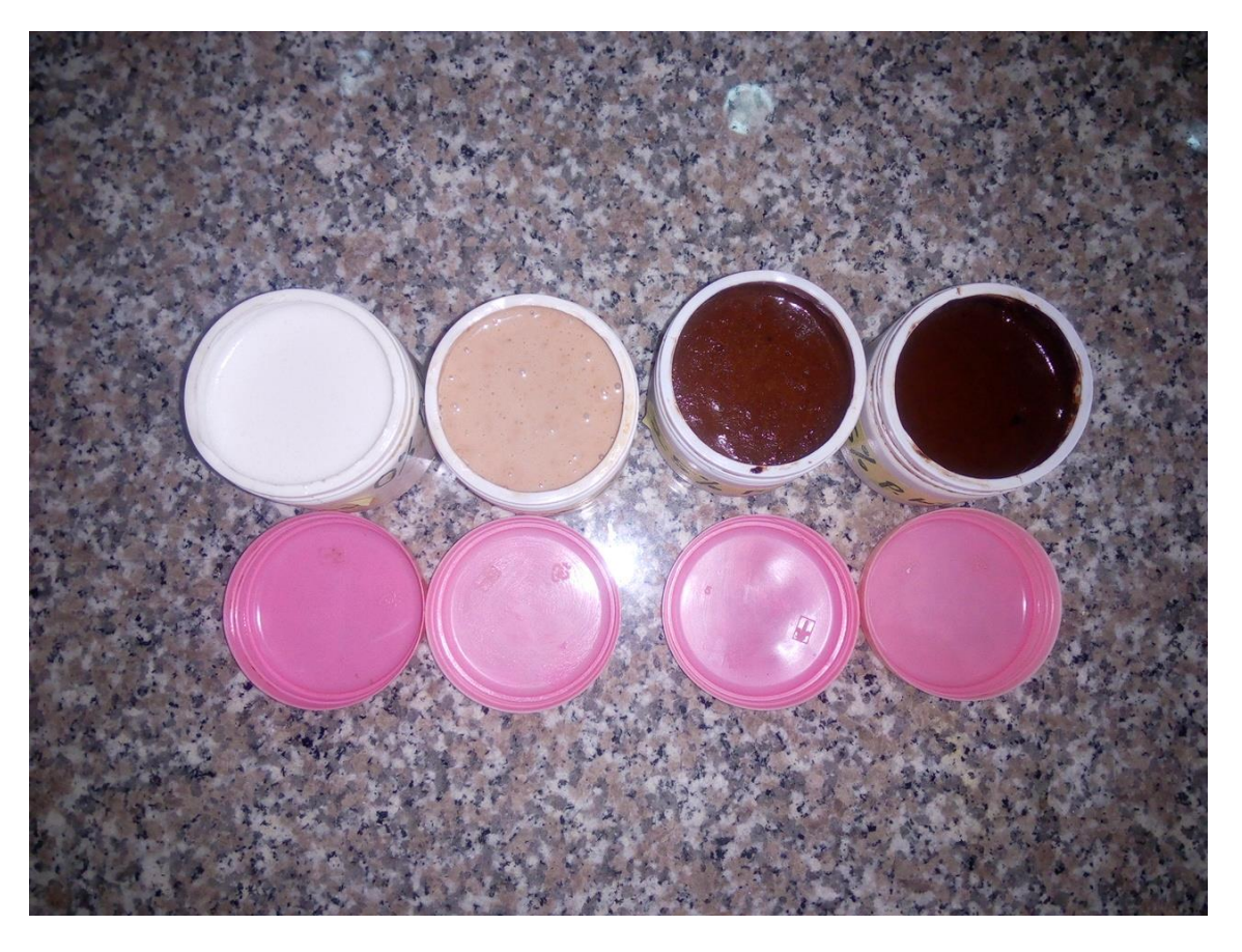
Fig. 1: Emulgel formulations containing varying concentrations of the extract of the stem bark of P. biglobosa.

Key: A = 0% of P. biglobosa extract; B = 0.5% of P. biglobosa extract; C = 2.5% of P. biglobosa extract; D = 5% of P. biglobosa extract.