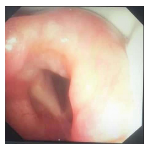
Figure 3: A lesion compressing the left main stem/upper lobe bronchus.