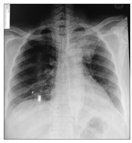
Figure 1: The plain chest radiograph showing opacities in the left upper lobe and apex.

This case presentation showed that trachea tumors are uncommon and the description of a new case, especially in African, enhances the understanding of this disease as it accounts for <1% of all malignancies.[8] The bronchoscopic