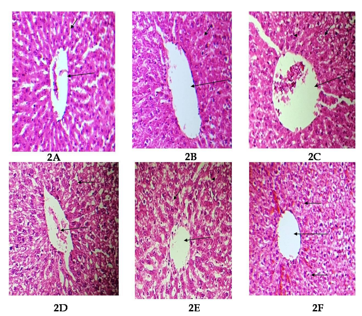
Figure 2: Representative Micrographs of Livers of Rats Treated with L. alata