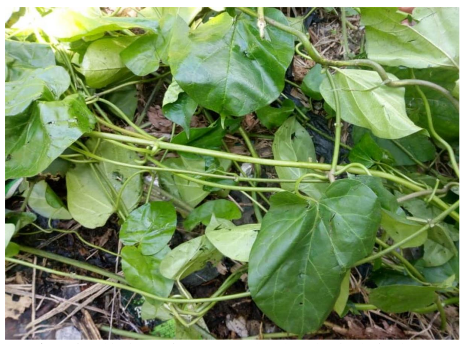
Figure 1: Habit picture of Gongronema latifolium showing leaf and stem