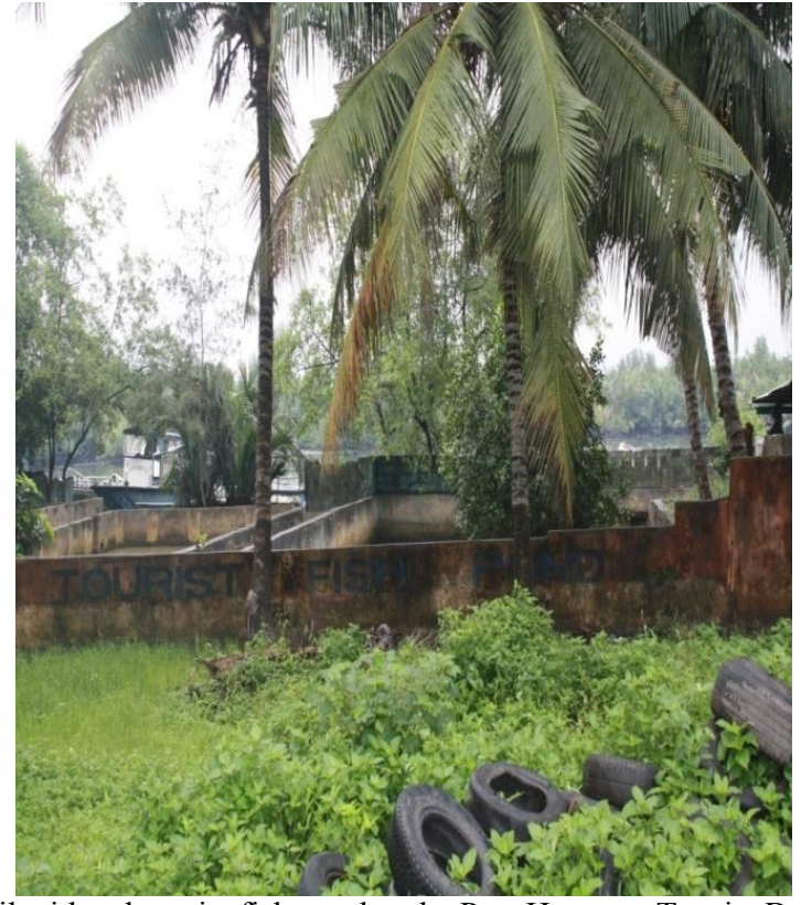
Plate 1: Dilapidated tourist fish pond at the Port Harcourt Tourist Beach