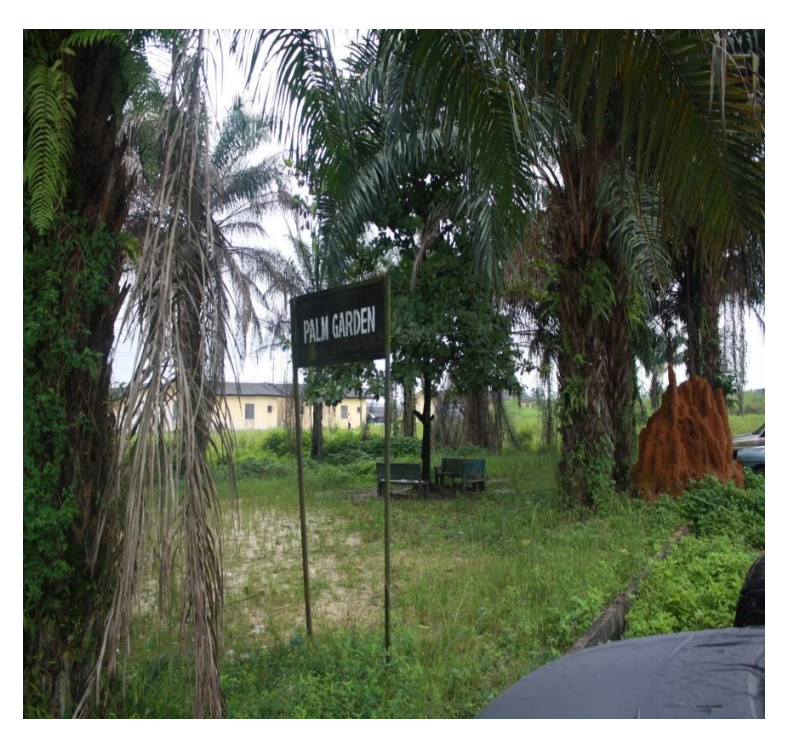
Plate 2: Tourist palm garden overgrown by weeds in Port Harcourt tourist beach.