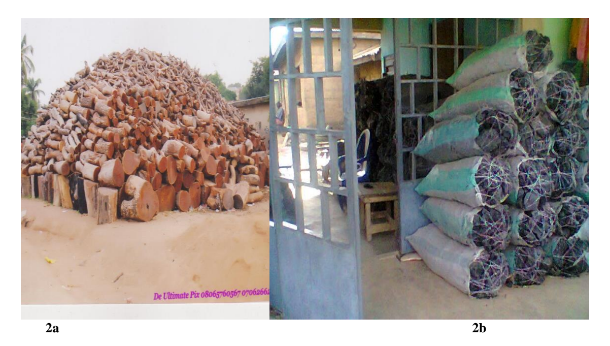
Plate 2: A heap of firewood and bags of charcoal on display for sale at Pever Ge Street and Ahmadu Bello Way, Gboko East, 2013. Though the wood products above were not obtained from the reserve, the plates meant to show the general impact of fuel wood collection forest.