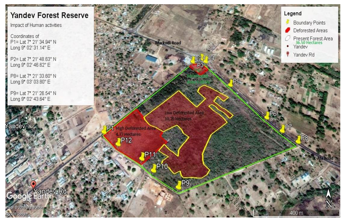
Fig 2. Aerial photograph of Yandev Forest Plantation showing the size of deforested areas

Note that points (P1 - P12) in fig 2 show coordinates and boundary of the plantation while the deep and light red colours represent low and high deforested areas.