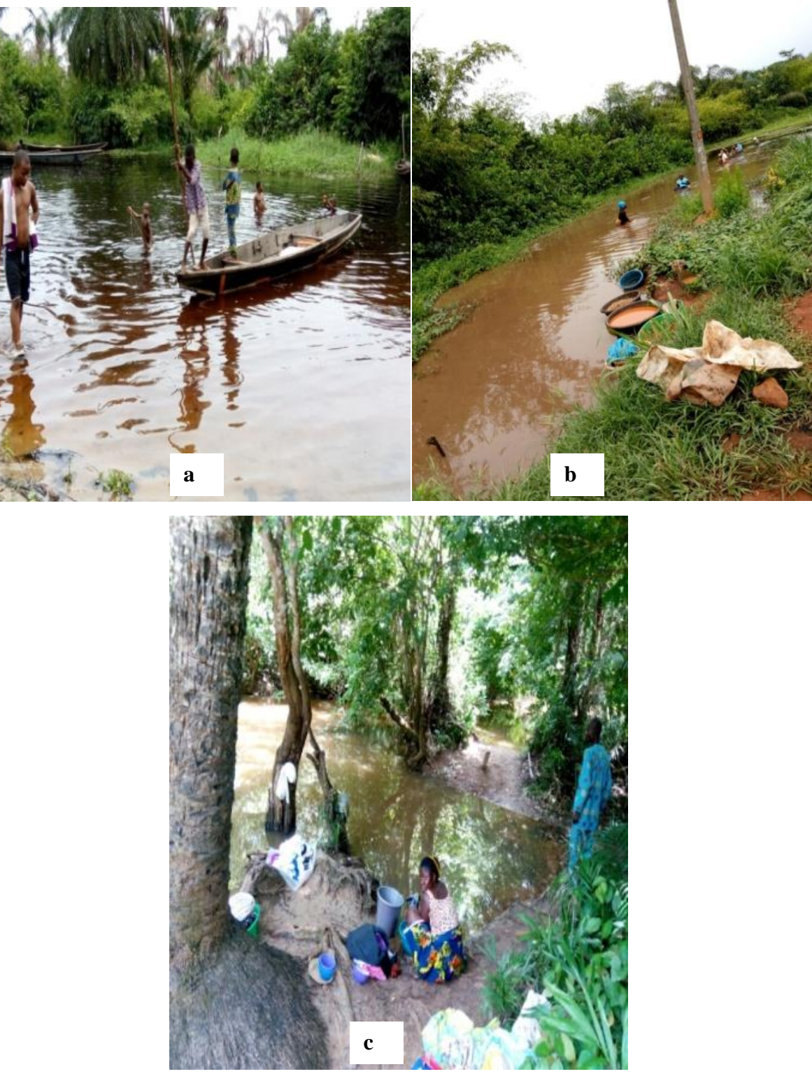
Figure 1: Different human activities in the water bodies sampled