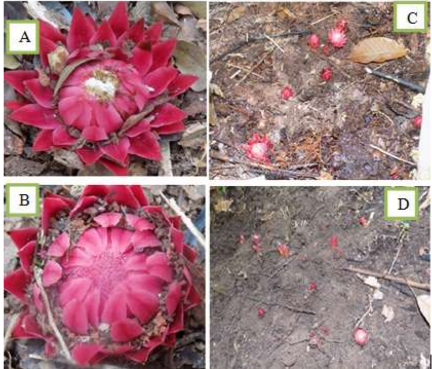
Figure 2: A closeup of Thonningia sanguinea inflorescence at the Okomu National Park, Edo State. (A) Male plant (B) Female plant (C) & (D) Aggregated nature of the population.