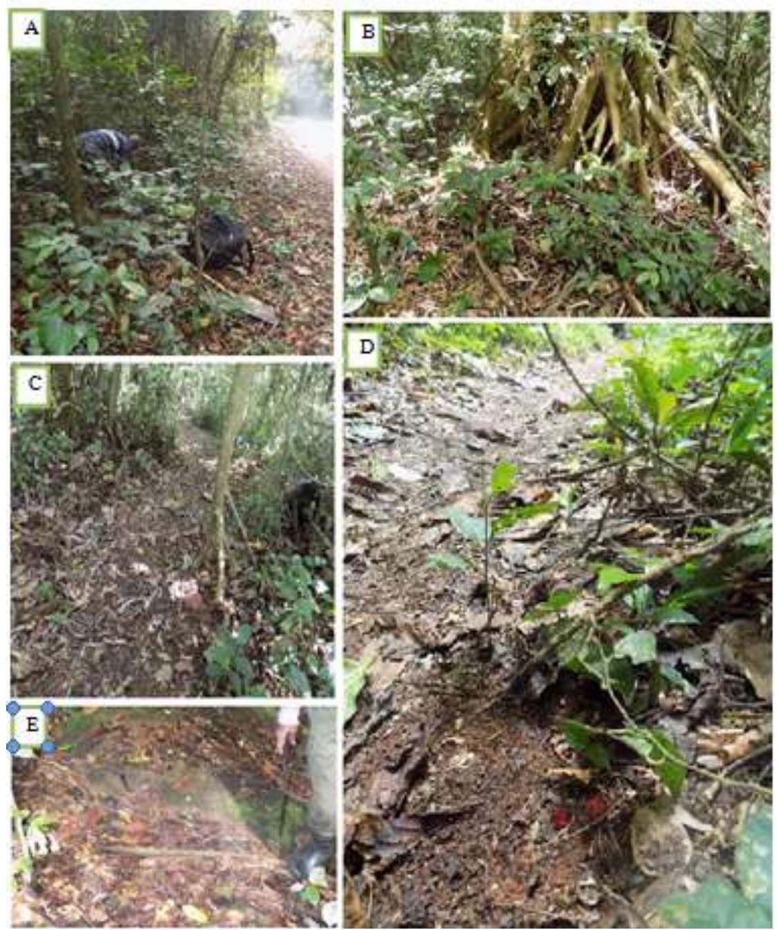
Figure 4: The regular nature-trail habitat preference of Thonningia sanguinea ; parasitizing host trees along the forest trails (sites identity: A- Okomu N. P.; B- Okokhuo C.F; C- Ofosu F. R.; D- IITA F.R.; E- Cross River N. P.).

Legend: N.P (National Park), C.F. (Community Forest), F.R. (Forest Reserves)