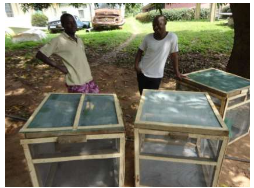
Plate 1: Cages constructed in this experiment for the culture of the mudfish Clarias gariepinus in River Benue

blocks were used as anchors. The cages had a cover, which aided during feeding and removal of fish for collection of sampling data. The frame of the square cage was nailed to each other with ½ inch nail, before a metallic mesh was used to cover the frame. Floats were attached to the cage at the four edges. Anchors were attached to the frame of the cage with the use of a rope attached to the cage. The cages were in triplicates