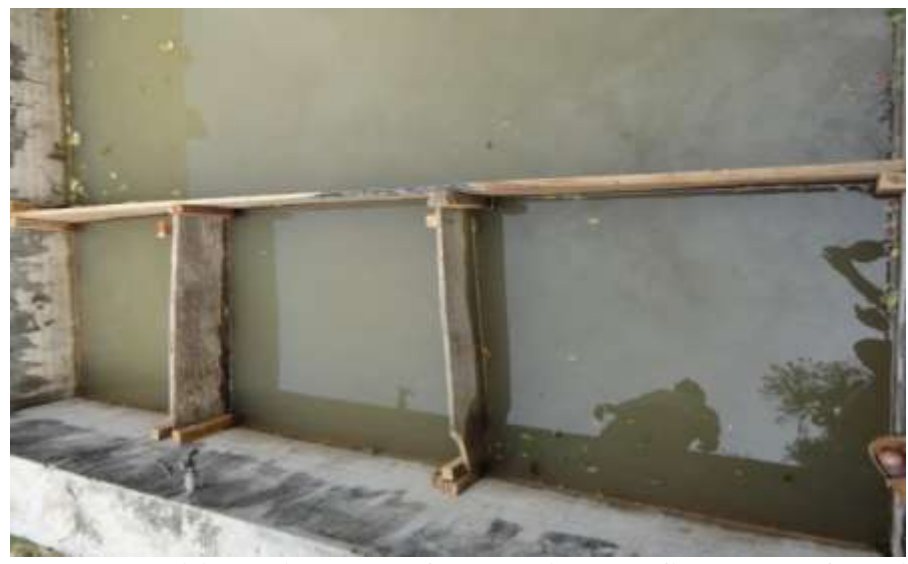
Plate 2: Concrete pond partitioned into three for experimental fish culture for this experiment

The cages were placed near the Benue State Department of Fisheries premises away from the