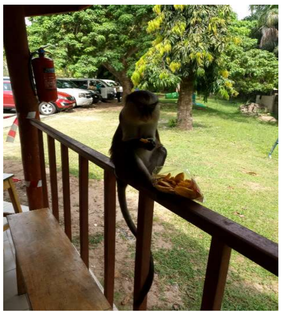
Plate 1: Mona monkey eating plantain chips snatched from a visitor to Lekki Conservation Centre