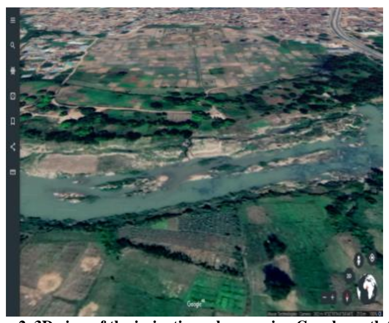
Figure 2. 3D view of the irrigation scheme using Google earth 2019