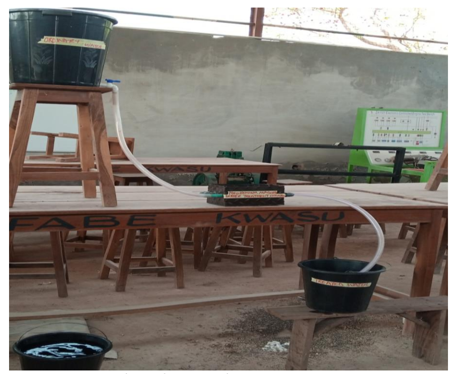
Figure 2: Magnetic water treatment

neodymium magnets (N50 grade, 50mmx25mmx10mm); each magnet weighed 84.5gram fixed to a metal frame with 45mm distance between pairs and 20mm to the two edges. The magnetic flux densities at the outlet measured by digital magnetic gauss meter model TD 8620 was 112.74mT or 1127.4G. The mean flow rate for two runs of water treatment was 2.86 litres/minute.