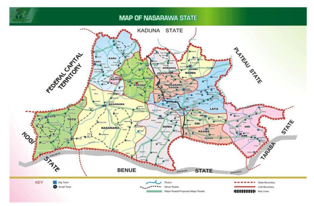
Figure 2. Map of Nasarawa State showing Local Government, Development Areas and Villages