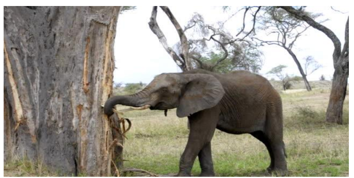
Plate 2: Barks tearing by elephants in Serengeti National Park