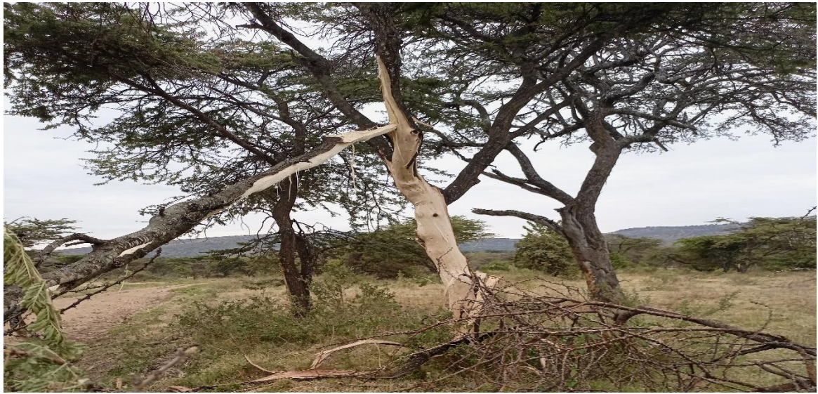
Plate 1: Tree debarking, damage caused by elephants