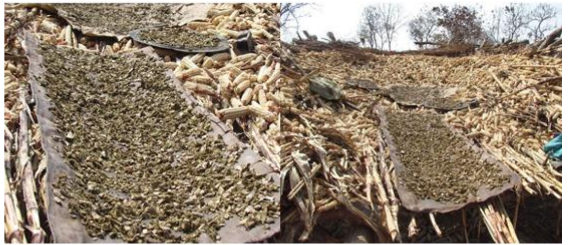
Plate 1: The traditional herb (Malongwe) is used to keep elephants from attacking harvested crops in Simbanguru and Mangoli villages, Tanzania.

The study also sought to understand the communities' awareness of traditional knowledge for safeguarding themselves from dangerous wild animals. About 70(76%) of the respondents used traditional methods to deal with wildlife attacks, while the respondents did nothing since they had no knowledge of what to do were 20(21.7%) and the undecided were 2(2.3%). Among the traditional methods used by the community to chase elephants, for example when they are about to invade habitats or crop farms, are catapults, fire, and acoustic scarers. Other respondents reported using poisonous traditional herbs commonly known as 'Malongwe' in the stored harvested food (Plate 1).