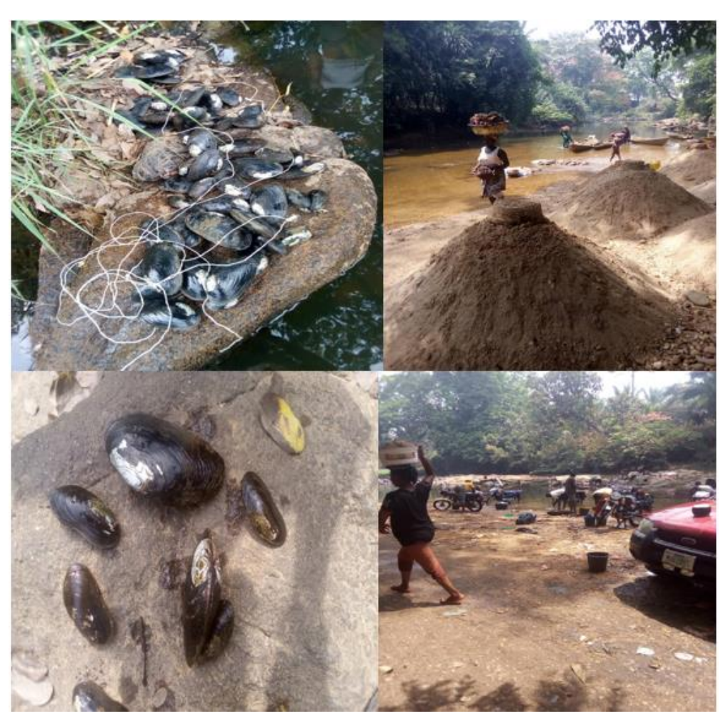
Figure 2: Sample of pearl Mussels and other activities in the river Baissa.