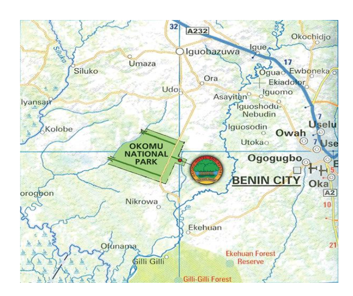
Figure 1: Location of Okomu National Park

The study area was Okomu National Park located in Ovia South West Local Government Area of Edo State. It lies between longitude 6^0 21'N and latitude 10^0 11'N (FORMECU, 1999) with fresh water swamp along the rivers located within the park. The Park covers a total area of 202sq km (making it the smallest of the seven National Park) which is only about 15% of the 1,082sqkm covered by the Okomu forest reserve