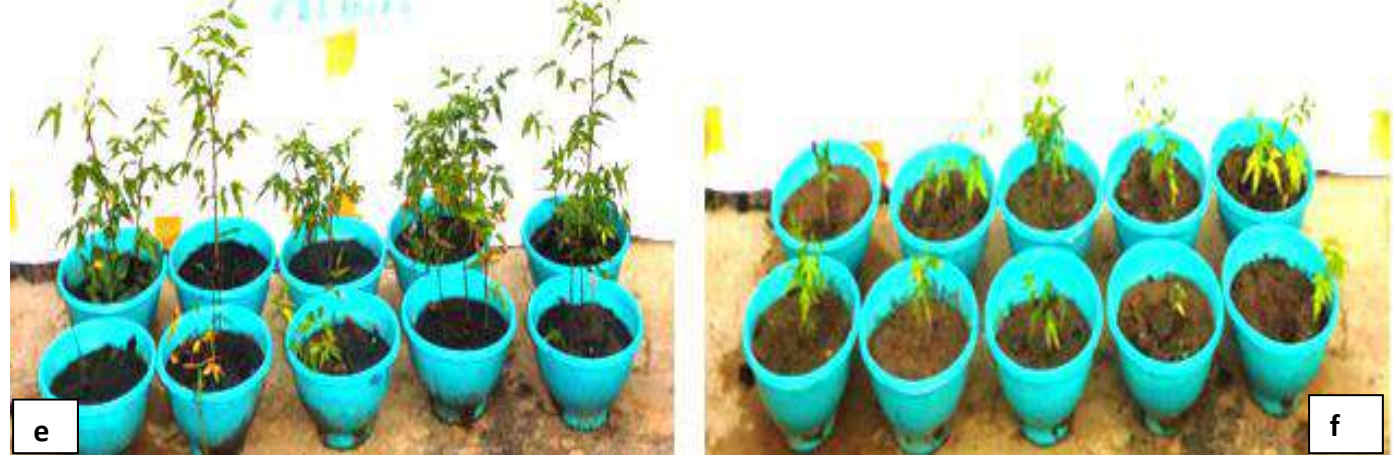
Plates e: Early growth of Azadirchta indica (neem) on uncontaminated soil.f: Early growth of Azadircht aindica on contaminated soil.