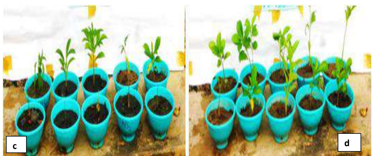
Plates c: Early growth of Adansonia digitata on contaminated soild: Early growth of Adansonia digitata uncontaminated soil.

Plate a: Earlygrowth of J. curcas on contaminated soil. Plate b: Early growth of J. curcas on uncontaminated soil.