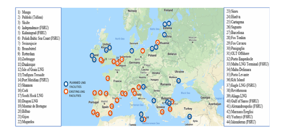
Figure 1: LNG Import Terminals in Europe

Among gas imports, although the share of LNG in imports has increased, pipeline gas trade is still dominant in Europe. As shown in (Figure 2), there are 24 LNG facilities owned by 11-member states. The total import capacity of the 24 facilities was 210 bcm in 2017. With the completion of the planned facilities' constructions, LNG import capacity of the Union will rise to 282 bcm in 2026. <sup>24</sup> The planned facilities will be in Croatia, Estonia, Germany, Greece, Ireland, Italy, Latvia, Malta, Poland, and the UK. Besides the EU countries, one LNG facility was planned for Albania, one in Ukraine and two in Turkey.