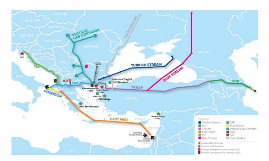
Figure 3: An Expanded Southern Gas Corridor

currently the Balkan markets are very small and premature, and therefore these markets are commercially less profitable for Azerbaijan. Therefore, the additional supply of Azeri gas is dependent on the capacity improvements in TANAP and TAP as well as favourable market conditions in the Balkans. Another importance of these two pipelines (TANAP and TAP) is that they can contribute to Italy's and Greece's aspirations to become a Mediterranean gas hub.