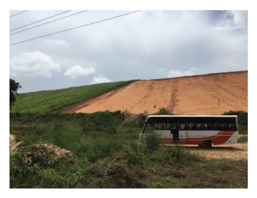
Figure 1: The Tailings Storage Facility Undergoing ProgressiveReclamation

In preparation for closure and reclamation of the mine area, Base Titanium has established an indigenous trees species and grass regeneration program, which is currently boasting over 100 species of plants and grasses. The trees and shrubs are being progressively used in the gradual rehabilitation program that has been commenced in sections of the mining area where mineral resources have been exhausted<sup>57</sup>.