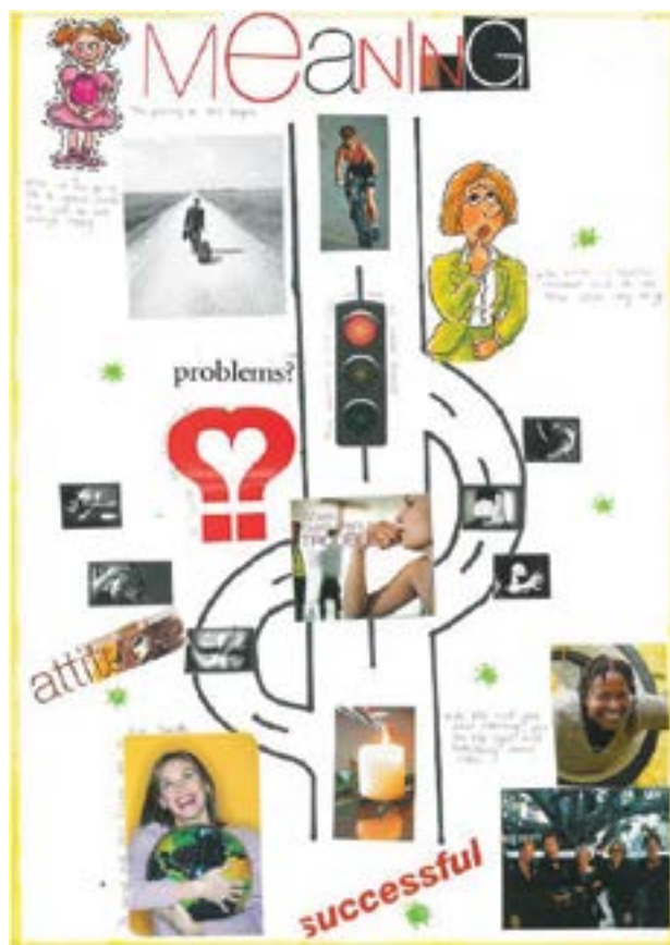
Figure 3: Dealing with stress (Participant 47)

a relationship as follows: “The future always brings new beginnings ... must trust that good things will come your way ... that helps to keep me focused.” Additionally, participant 47, a 24-year-old female, included the following image that depicts the journey of dealing with stress (Figure 3):