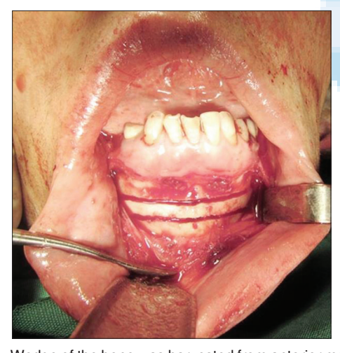
Figure 1: Wedge of the bone was harvested from anterior mandibular subapical osteotomy

Anterior Palatal Island Advancement Flap was effective in bone graft coverage in premaxillary edentulous area [Figure 4].