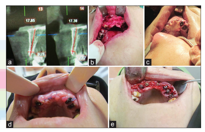
Figure 2: (a) Cone-beam computed tomography of anterior maxilla with thin width alveolar ridge. (b) Maxillary anterior buccal onlay bone grafting. (c) Tensionless coverage of bone graft with Anterior Palatal Island Advancement Flap. (d) Postoperative photograph 3 weeks after operation. (e) Implant insertion into the bone graft and adjacent fresh extraction socket

Second group flaps need time for secondary epithelialization. Palatal mucosa is supplied by six pairs