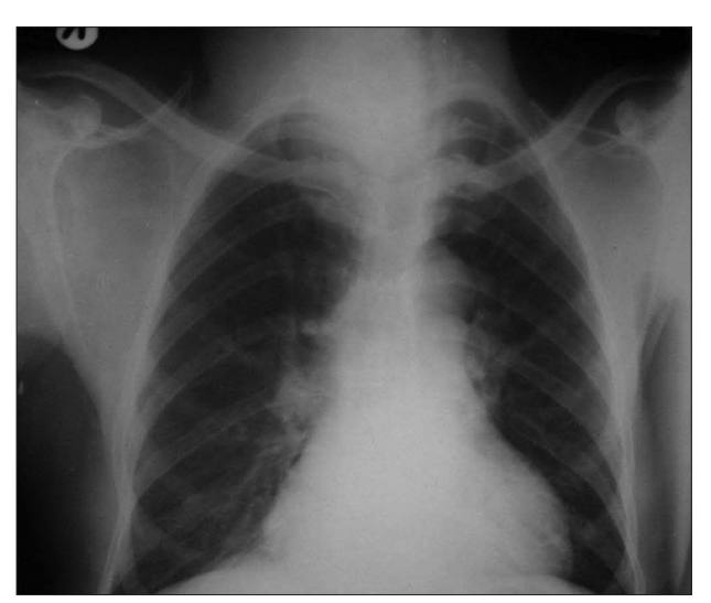
Figure 3: Patient chest radiograph showing thyroid mass essentially to the right of midline in the lower aspect of the neck, tracheal deviation to the left, coronal tracheal narrowing and retrosternal extension. Note the hilar soft tissue masses with lobulated margin presumed to be lymphadenopathy

Fine needle aspiration cytology of the thyroid showed malignant tumor and the histology of the scalp metastasis showed follicular carcinoma.