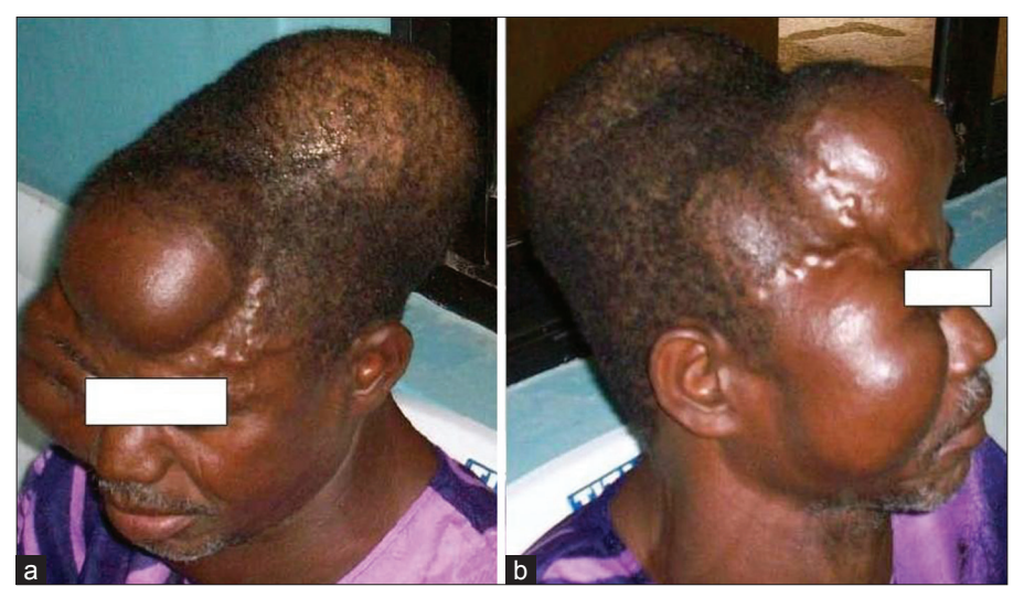
Figure 1: (a,b) Photographs of the 58-year-old man with metastatic follicular thyroid carcinoma showing multiple scalp and facial masses. Note in a and b the tortuous and engorged superficial vessels on the left upper aspect of the face and in (b) the right sided thyroid swelling

The complete blood count, serum electrolyte urea and creatinine, abdominopelvic ultrasound, and thyroid function tests were normal.