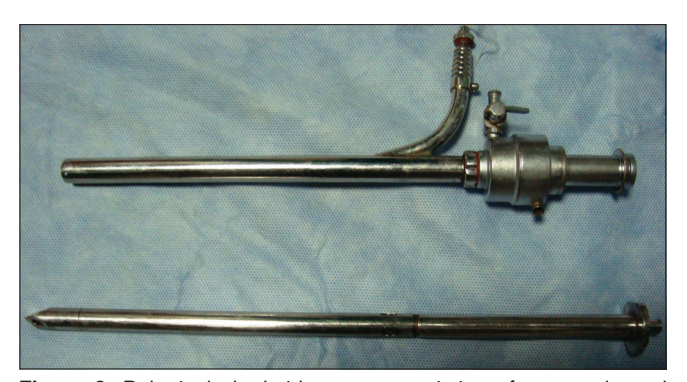
Figure 2: Palanivelu hydatid system consisting of a cannula and a trocar