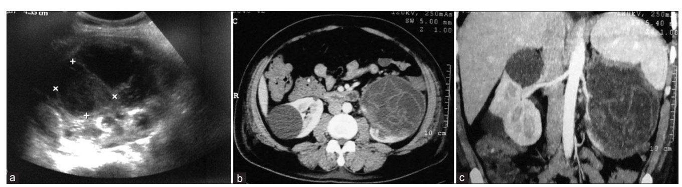
Figure 1: (a) USG showing multilocular hydatid cyst. (b and c) CECT showing left renal hydatid with multiple daughter cysts