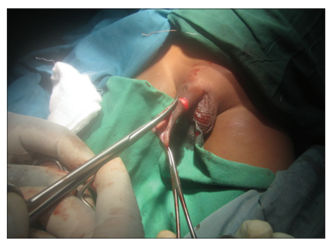
Figure 5: Dorsal slit