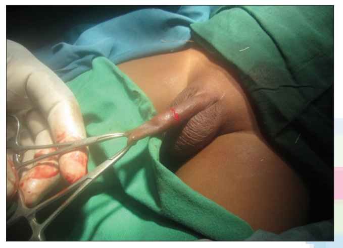
Figure 3: Circumferential knife skin mark