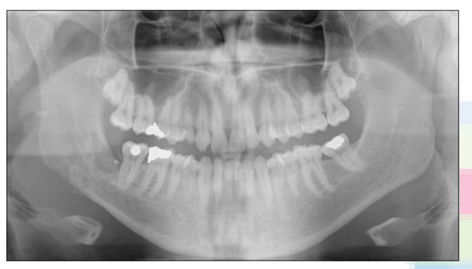
Figure 3: Panorex view of the mandible

The local control of this tumor constitutes continuing treatment dilemma and the clinical management remains a challenge. Even following complete resection of the tumor with clear margin, local failure is common. Reported recurrence rates vary from 25% in cases of complete excision in patients with head and neck desmoid tumors to 80% in patients who had incomplete excision.<sup>[9]</sup>