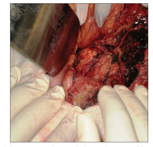
Figure 2: Intraoperative photograph showing laceration of the pancreas (arrow)

surface of the pancreas at the lacerated site [Figure 5]. Anterior Roux-en-Y pancreatico-jejunostomy was done with suturing of edges of the laceration of pancreas to the side of Roux-en-Y loop of the jejunum [Figure 6].