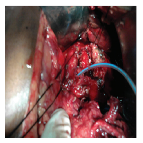
Figure 5: Intraoperative photograph showing lacerated pancreas. Pancreatic duct is shown cannulated with feeding tube

surface of the pancreas at the lacerated site [Figure 5]. Anterior Roux-en-Y pancreatico-jejunostomy was done with suturing of edges of the laceration of pancreas to the side of Roux-en-Y loop of the jejunum [Figure 6].