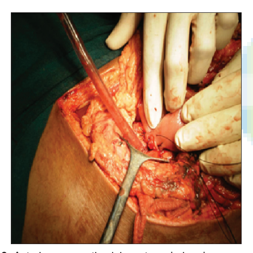
Figure 3: Anterior pancreatico-jejunostomy being done