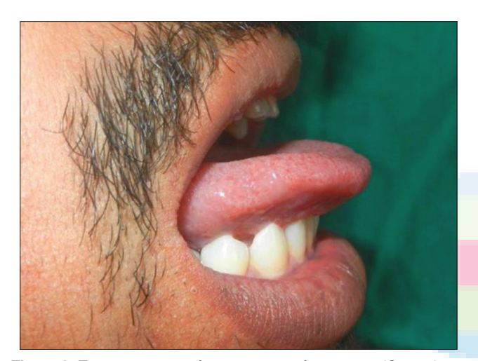
Figure 9: Tongue position after protrusion after 2 years (Case 2)