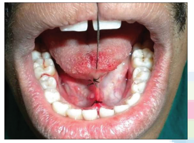
Figure 3: Two vertical rows of suture parallel to each other (Case 2)