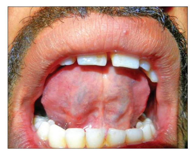
Figure 8: Follow-up after 2 years (Case 2)

3. Encourage tongue movements related to cleaning the oral cavity, including sweeping the insides of the cheeks, fronts and backs of the teeth, and licking right around both lips.