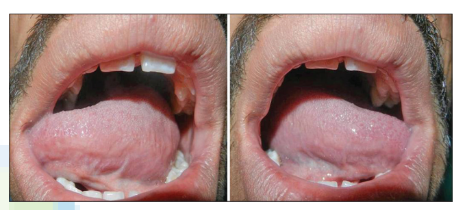
Figure 10: Tongue position on left and right lateral movement after 2 years (Case 2)

Thus, this technique provides promising result in management of severe ankyloglossia with just suturing prior to lingual frenectomy. However, to confirm the potential of this surgical technique long term interventional randomized clinical trial need to be carried out.