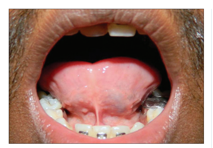
Figure 1: Preoperative view – Class II ankyloglossia (Case 1)