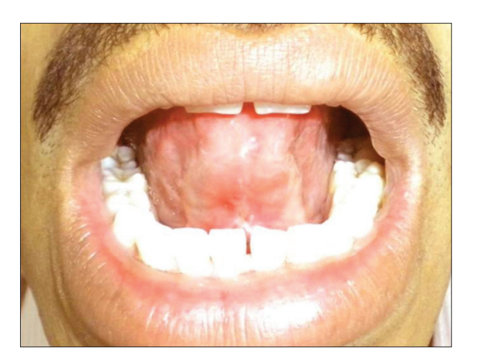
Figure 7: Postoperative 1-week view (Case 2)