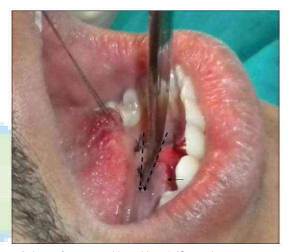
Figure 4: Line of incisions (dotted lines) (Case 2)