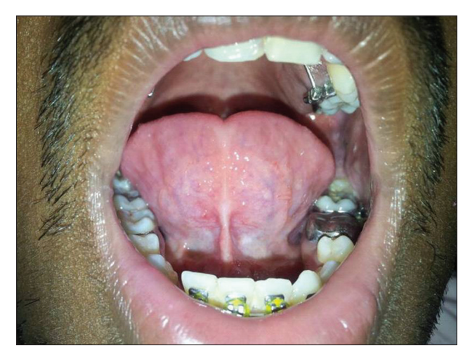
Figure 11: Follow-up after 2 years (Case 1)

3. Encourage tongue movements related to cleaning the oral cavity, including sweeping the insides of the cheeks, fronts and backs of the teeth, and licking right around both lips.