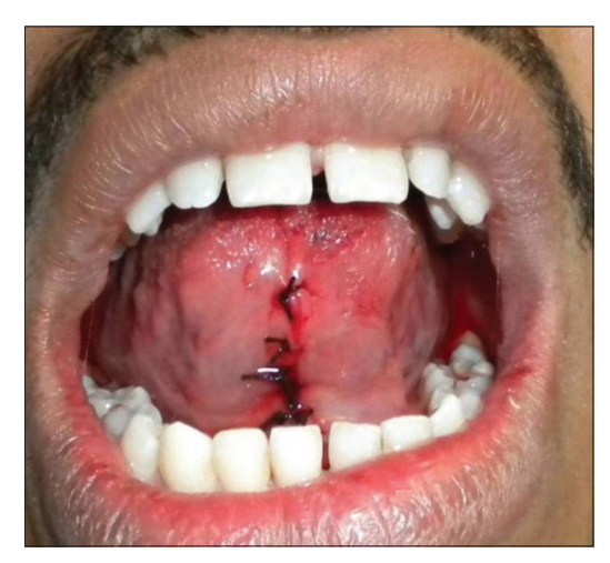
Figure 6: Immediate postoperative view (Case 2)

stretching of the tongue with a protrusive action. Patients were instructed to continue this exercise 3-4 times daily for 2 min until the incision healed. Sutures were removed carefully 1-week after surgery.