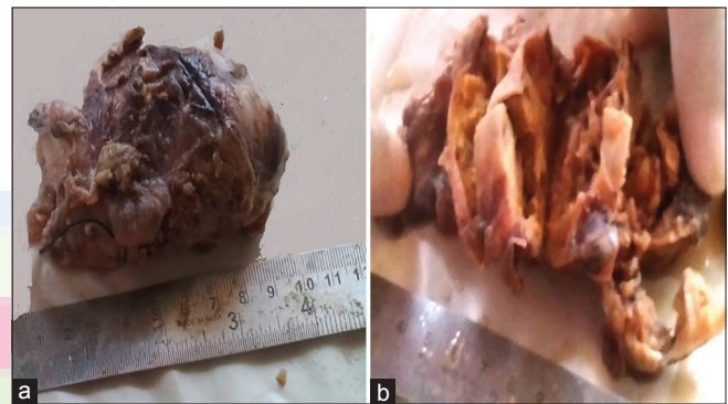
Figure 2: Gross images show (a) A well-circumscribed mass with intact capsule (b) cut-surface shows cystic change with extensive necrosis